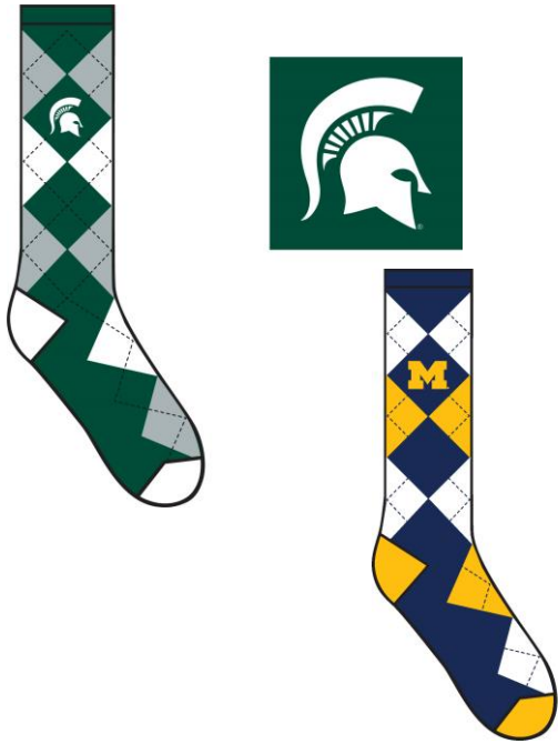
Argyle – XMDA1