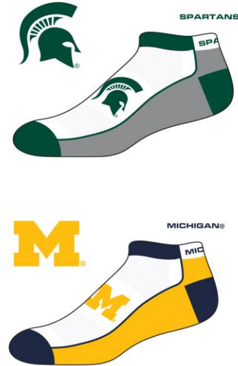
Low Cut Stripe – LB59R1