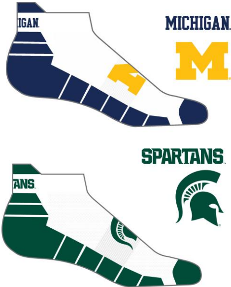
Tab – LTAB1