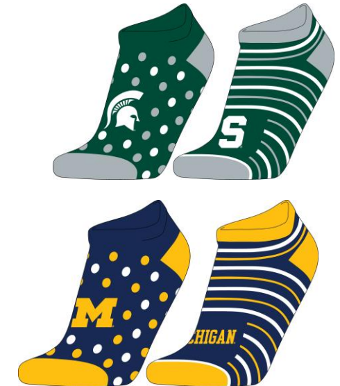
Ladies Stripe & Dot – XR6602 2 pack