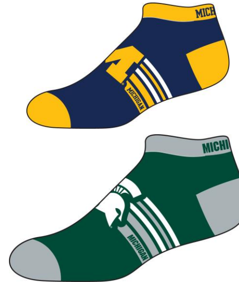
Varsity - LRVRS