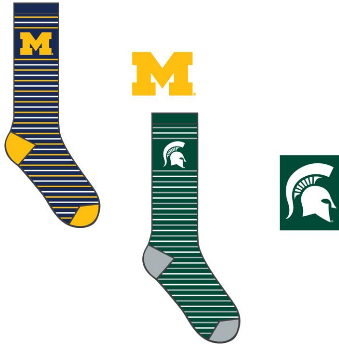
Dress Stripe – XMDS1