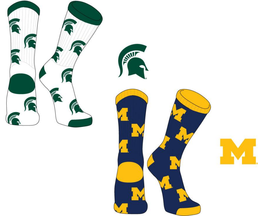
All Over – XMDG1